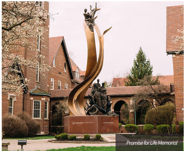
Promise for Life Memorial

The plaza surrounding the finished sculpture, which was dedicated in 1999, is paved with over 100 bricks inscribed with the word “Remember” in different languages.