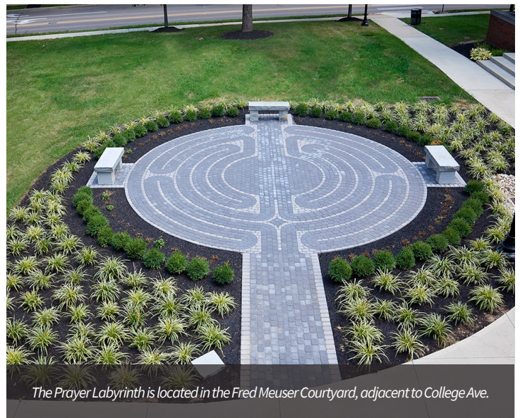
The Prayer Labyrinth is located in the Fred Meuser Courtyard, adjacent to College Ave.

and for those in active ministry. I gave thanks for the past 18 years of my life that have brought me to this point.