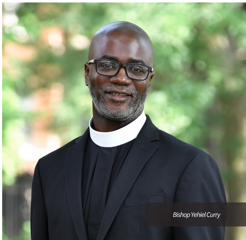
Bishop Yehiel Curry

Registration is open now at capital.edu/trout-lectures/