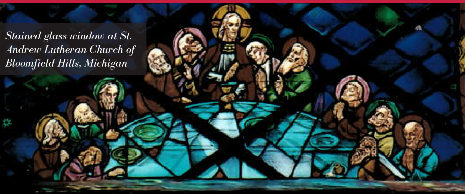
Stained glass window at St. Andrew Lutheran Church of Bloomfield Hills, Michigan